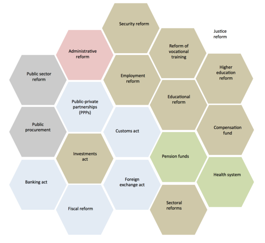
Figure 3: Proposed economic and social reforms in Tunisia