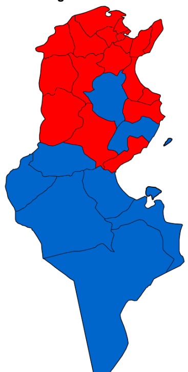
Figure 1: Voting results in Tunisia's 2014 parliamentary elections.

Red governorates were won by Nidaa Tounes Blue governorates were won by Ennahdha.