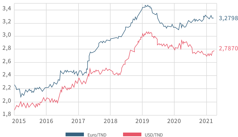
Figure 1 : Changes to the dinar exchange rates against the Euro and the US Dollar

This analysis will therefore focus specifically on the negative impacts of the relatively prolonged devaluation of the dinar from 2016 to 2018 (see Figure 1).